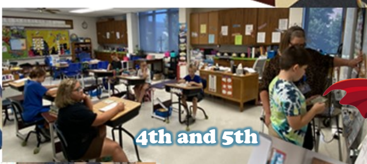
4th and 5th