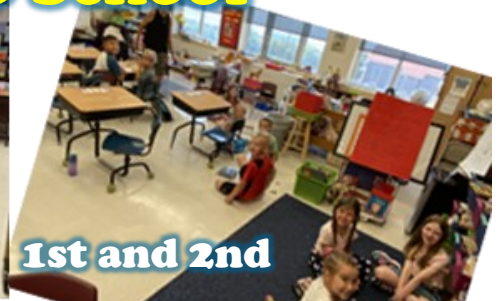
1st and 2nd