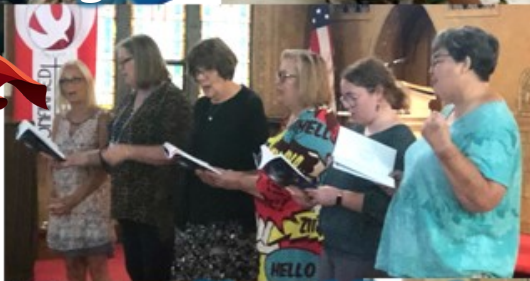
1st Chapel Service