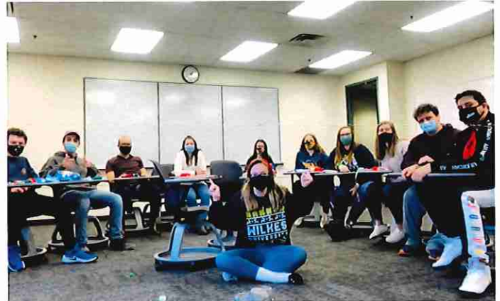
At Wilkes University, a growing number of students are rallying around the call to share the gospel with their classmates.