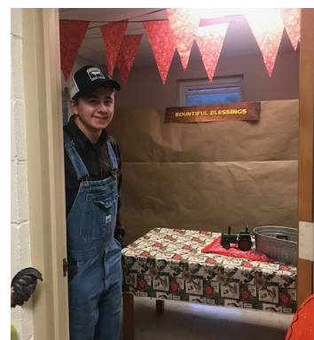
Trent's "Bountiful Blessings"