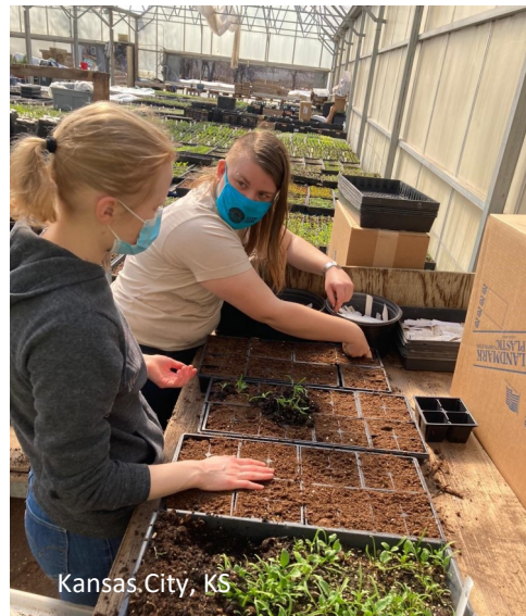
Kansas City, KS