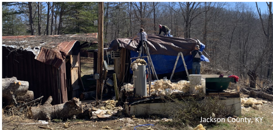
Jackson County, KY