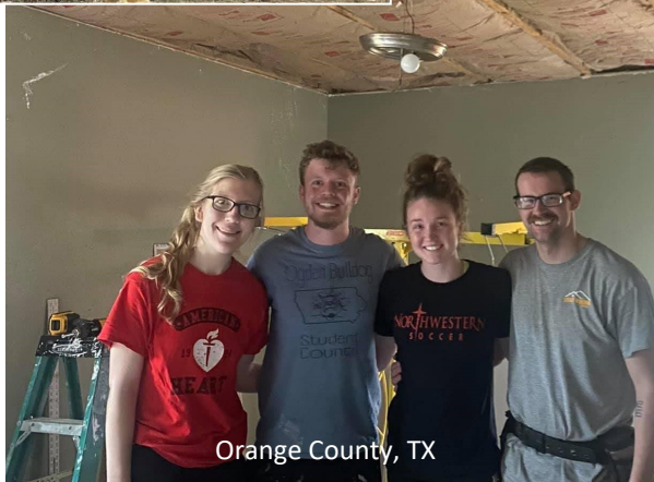
Orange County, TX