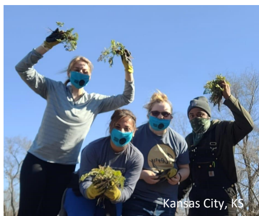
Kansas City, KS