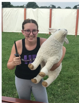
Students at the Tabernacle Exhibit by Messiah's Mansion