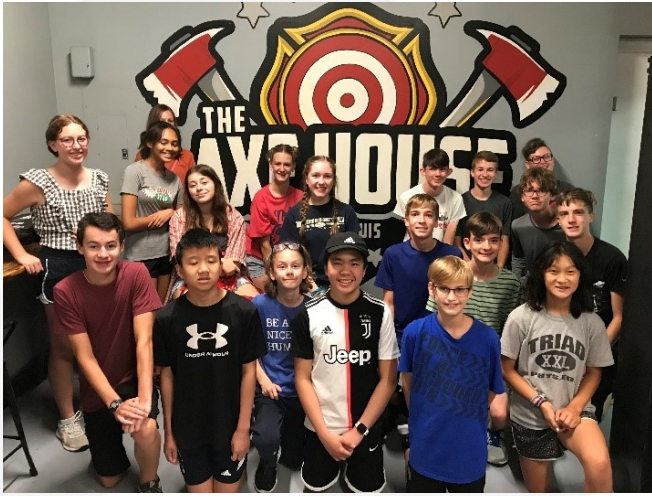
The Axe House