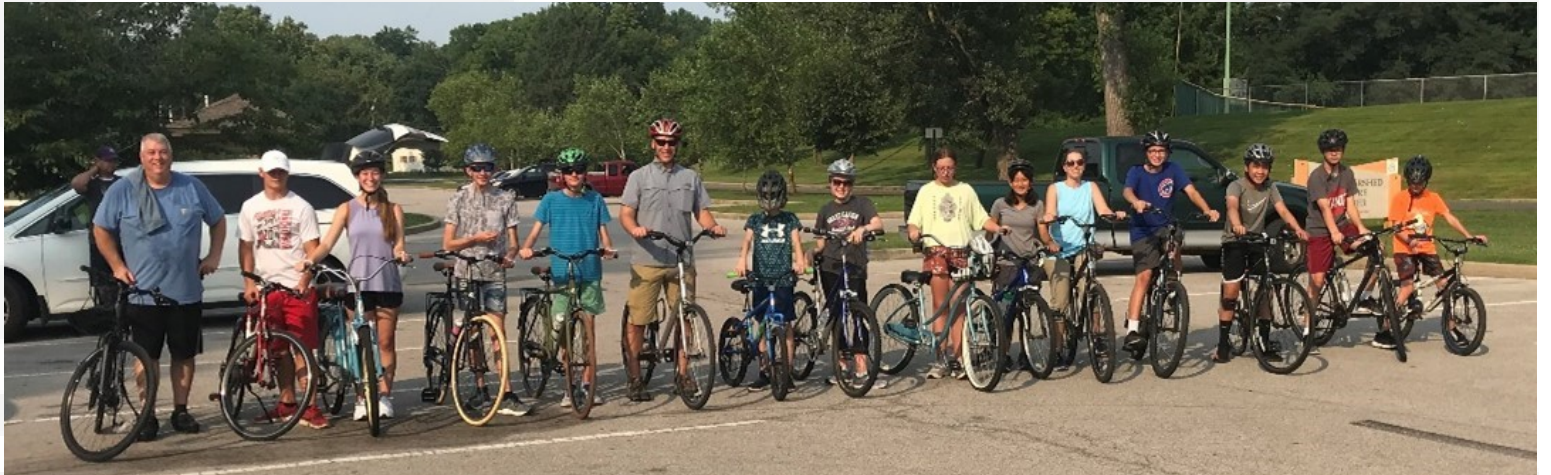
Paddle, Ride, Fire, & Pray at The Dubois Center