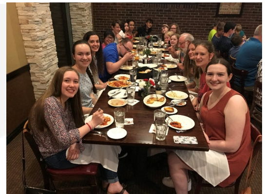
First Wednesday Night of the Summer – dinner at Favazza's On the Hill, St. Louis, MO "Jesus was known to them in the breaking of the bread."