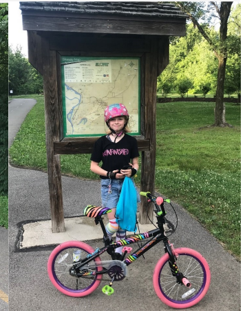
Bike Ride on Madison County Trails Glen Carbon to Watershed Nature Center on the Goshen Trail