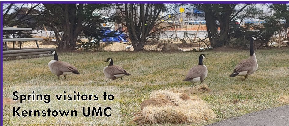
Spring visitors to Kernstown UMC