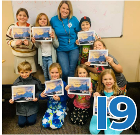
19 Kids completed New Believer's Class