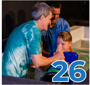
26 Kids baptized