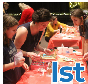
1st Gingerbread Family Challenge