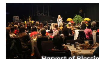
Harvest of Blessings

Billy Graham Tea Scavenger Hunt Ladie's Breakfast Harvest of Blessings Christmas Cookie Swap & Ugly Sweater Contest