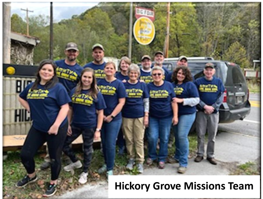
Hickory Grove Missions Team