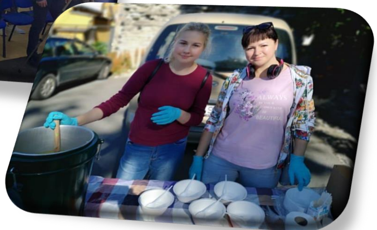
Church Outreach in Estonia