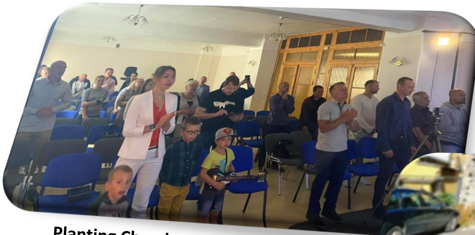
Planting Churches in Tallin, Estonia