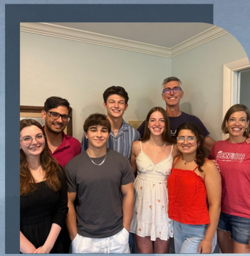
Mexico Orphan Mission (M.O.M.) Panuco, Mexico in the region of Veracruz